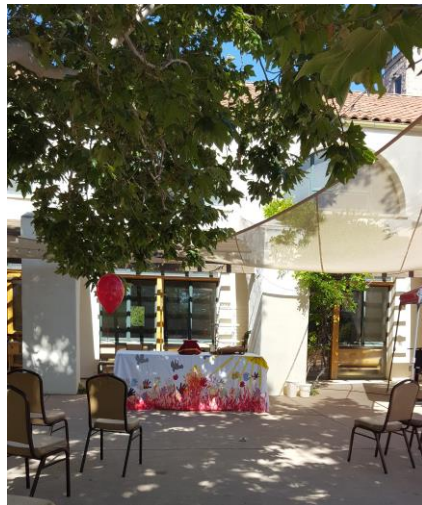
May 23, 2021 Pentecost on the Patio